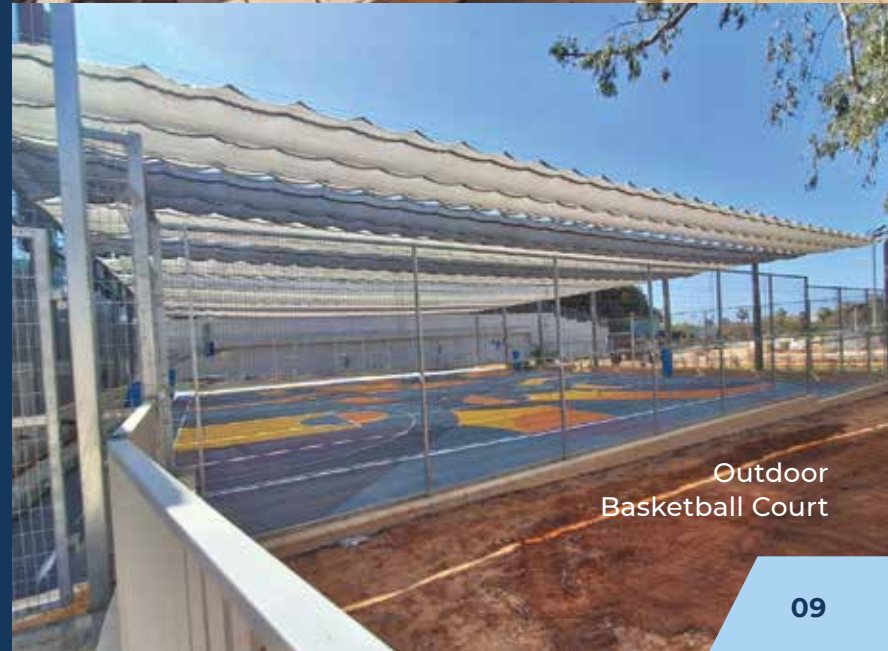
Outdoor Basketball Court