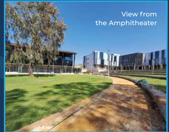
View from the Amphitheater

Gwen Straus High School and Evan & Layla Green Family Foundation Gogya Building