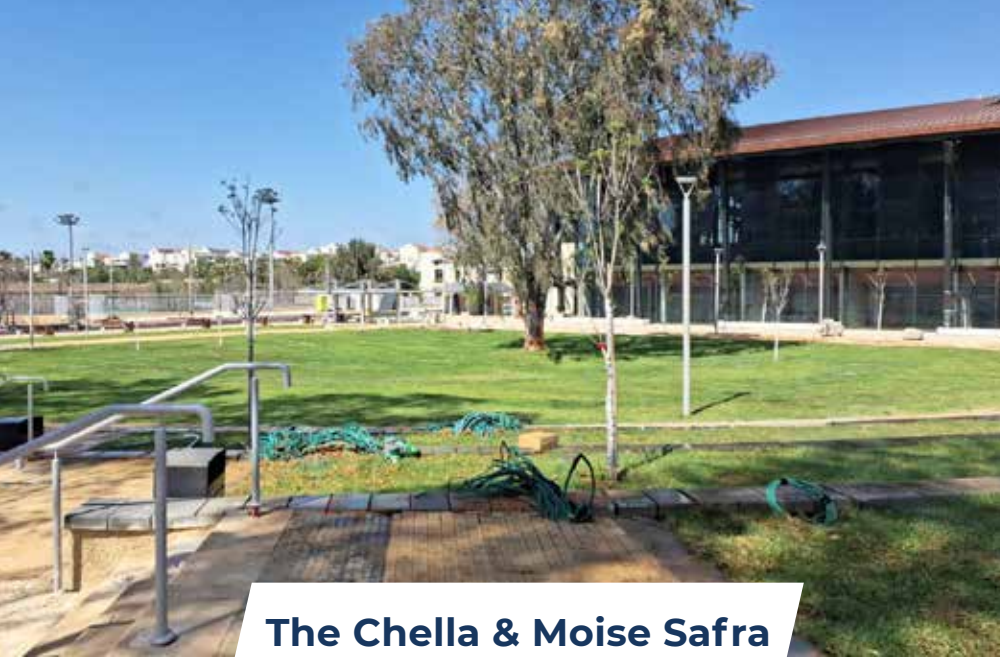
The Chella & Moise Safra Athletic Complex